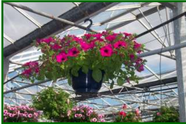
Trailing Petunia basket

These baskets benefit from a sunny position and the trailing petunia baskets need vigilant watering.