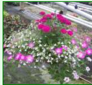
Colour themes available